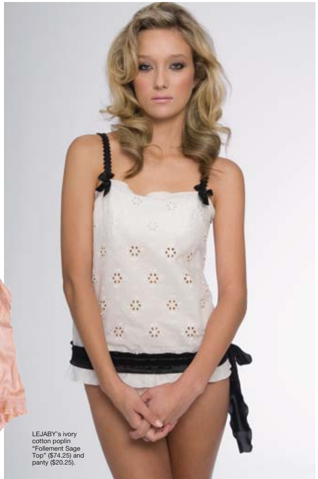
LEJABY's ivory cotton poplin "Follement Sage Top" ($74.25) and panty ($20.25).