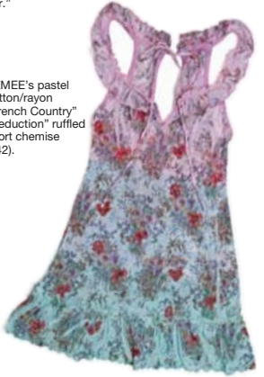
YEMEE's pastel cotton/nylon "French Country" "Seduction" ruffled short chemise ($42).