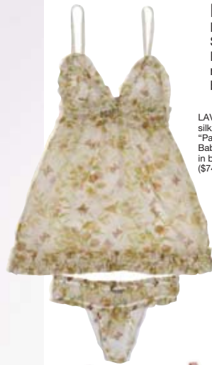
LAVANDE SWK's silk/cotton voile "Paula's Ruffle Baby" chemise in butterfly print ($74).

Designers look to nature for inspiration this Spring and treat it with a whimsical charm. Flowers were interpreted tactilely as sprouting rosettes and artistically in rose, wildflower and butterfly prints.