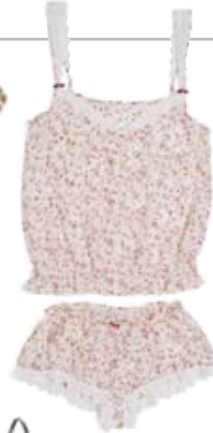
ROSY's "La Frivole" cami ($41) and shorty boxer ($29).