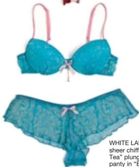
WHITE LAUNDRY's sheer chiffon "High Tea" plunge bra and panty in "English Breakfast" print (call for pricing).