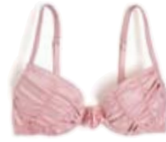
BLUSH's stretch-satin "Fleur De Peau" plunge bra and high hipster (call for pricing) in "Whisper."