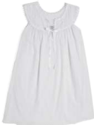
PRIMO's blue cotton batiste short nightgown ($52).