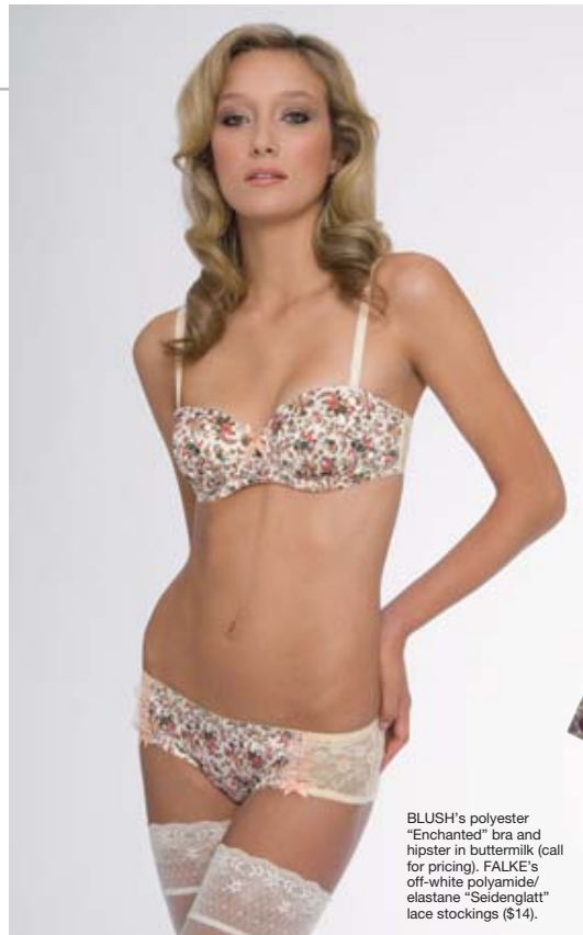
BLUSH's polyester "Enchanted" bra and hipster in buttermilk (call for pricing). FALKE's off-white polyamide/elastane "Seidenglatt" lace stockings ($14).