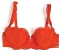
LEJABY's rigid tulle "Capri" uplift bra ($51.75) and tanga ($31.50) in Sanguine.