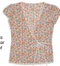
THIRD FLOOR DESIGN's pink cotton "Bluebell" wrap top ($45).