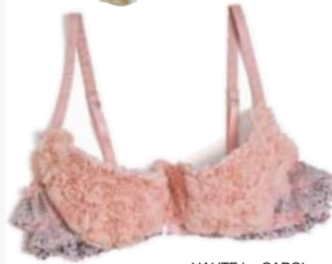
HAUTE by CAROL MALONY's peach silk "Morning Dew" balconette bra ($77).