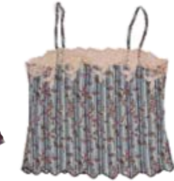
JULIANNA RAE's silk/Lycra "Nouveau" camisole ($32) and boyshort ($23.20) in "Nouveau Aqua."