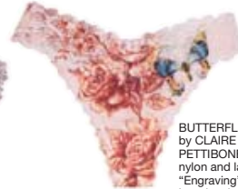
BUTTERFLIES by CLAIRE PETTIBONE's nylon and lace "Engraving" low-rise thong ($10).