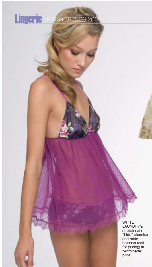
WHITE LAUNDRY's stretch-satin "Lido" chemise and ruffle hotshort (call for pricing) in "Antoinette" print.