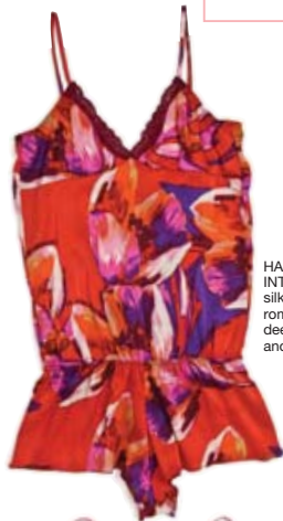
HALE BOB INTIMATE's red silk charmeuse romper with deep-V back and lace ($66).

Warm, vibrant colors coupled with fluid paisley prints take on the feel of Spain and the Mediterranean.